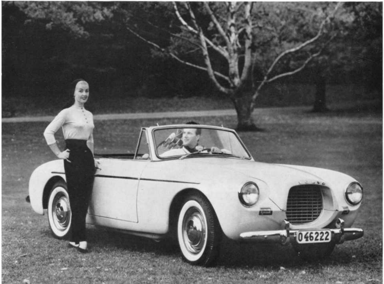
The Volvo Sport a plastic body which is now out of production.

sales side was not completely free from difficulties. It took a great deal of very hard work to create a sales organization for the excellent, robust but rather rural-looking automobiles-the first sedan we built described as likening a pregnant cow.