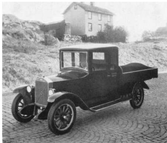
This truck from 1928 had a payload of 800 kg. (1,760 lb.)

A significant phase in our development was when we persuaded our Swedish sub-contractors to send technicians to foreign countries, primarily