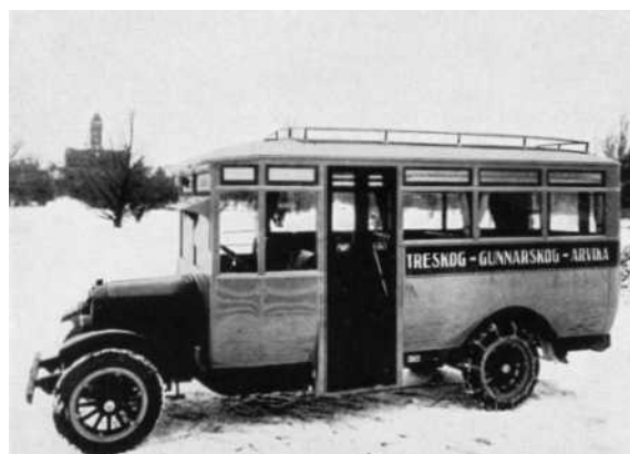
The first buses were not exactly beautiful-but they ran well.

The most important of these was to build a Swedish automobile so economically that it would be able to compete with American automobiles. Mass production was, naturally, the solution. But since the market would be limited to Sweden, at least during the first few years, the rate of mass production possible could hardly be on the same scale as in the United States. The question was whether the low Swedish rates of pay could com-