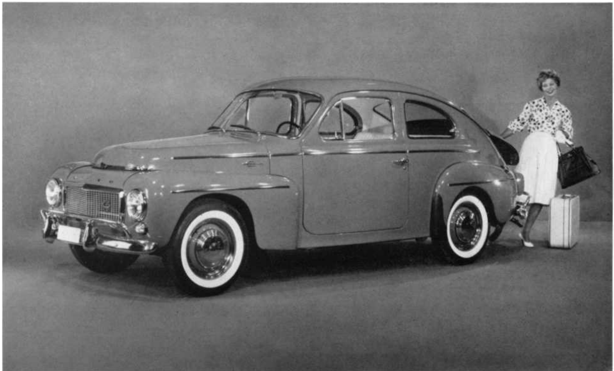
The PV 544 is in great demand in the United States.

later as people in general and experts in particular had an opportunity to see this automobile and even more important-to drive it.