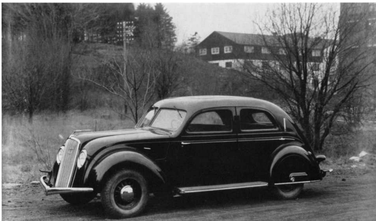
The first streamlined car-the PV 51 Carioca-made its appearance in 1936.

the United States, where they could learn the most modern manufacturing technique and use it in Sweden.