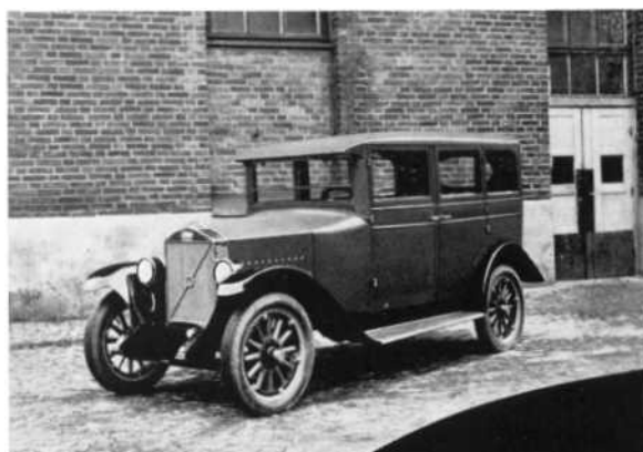
The PV 4—the first Volvo sedan with a leatherette-covered wooden body.

One problem which caused us a good deal of worry from the beginning was how to spread our sales out evenly during each year. After all we were building automobiles and in Sweden these are mostly sold during the spring and summer months. In order to maintain the same production level all the year round, we had to find some way to dispose of the surplus automobiles during the fall and winter. We decided to favour the Argentine and other countries south of the Equator with this surplus and of the thousand built during the first year we had reckoned on exporting 400. In point of fact not one was exported during the first two years and export was not essential either since we could not produce as many automobiles as we had planned and there was no difficulty in disposing of them in Sweden. We managed to even out seasonal variations during truck production which was begun during the second year. We found that truck sales were fairly even all the year round